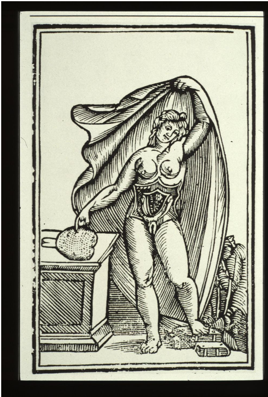
Jacopo Berengario, "Isagogae Breves," 1522; "[Y]ou see how the neck of the womb resembles the penis." From Thomas Laqueur, Making Sex: Body and Gender from the Greeks to Freud , 1990, fig. 16.